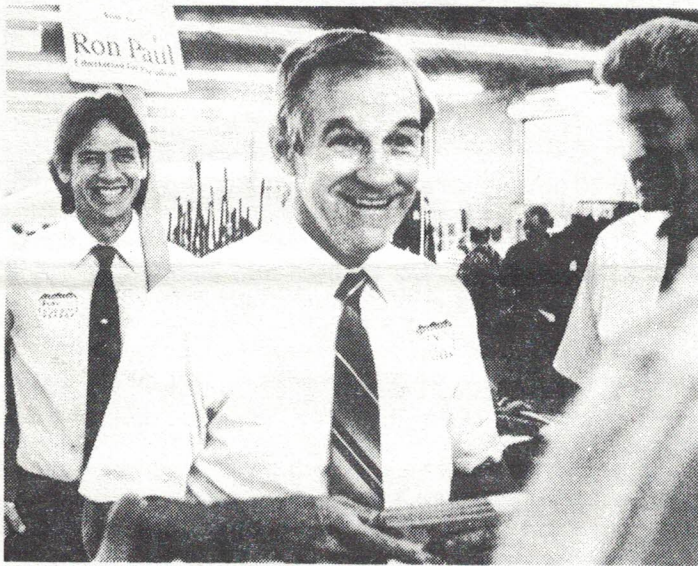
Ron Paul with supporters at Pomona gun show.

POMONA: A spur-of-the-moment visit to a large gun show at the Pomona Fair Grounds in July resulted in some good press for candidate Ron Paul, and may have made friends among those who recognize the importance of the Second Amendment. It was part of a brief tour of the Southland, a weekend marked by virtually non-stop campaigning.